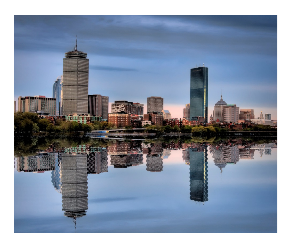
Omni Parker House - Boston, MA February 24-25, 2017