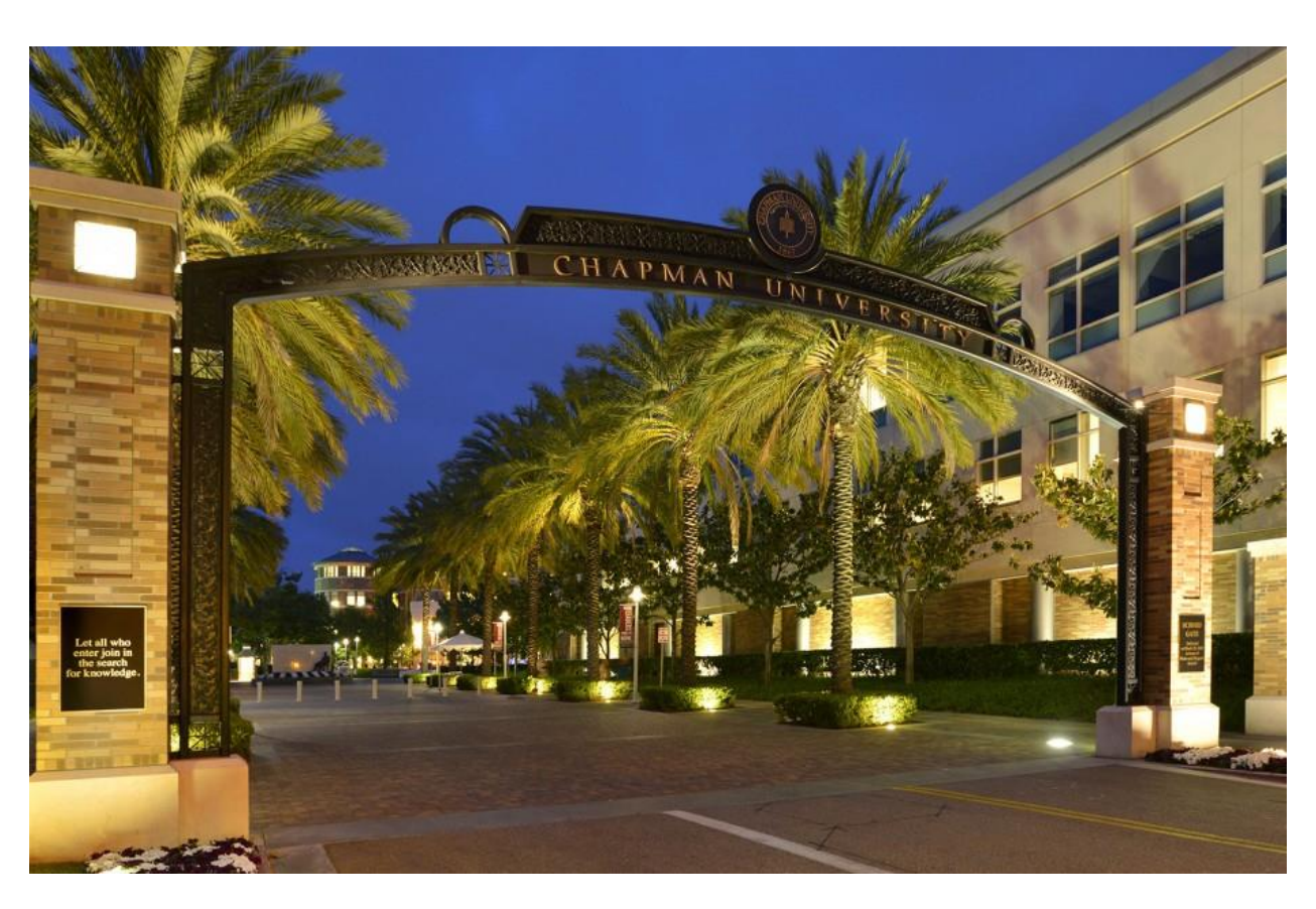
Chapman University - Orange, CA March 27-28, 2020